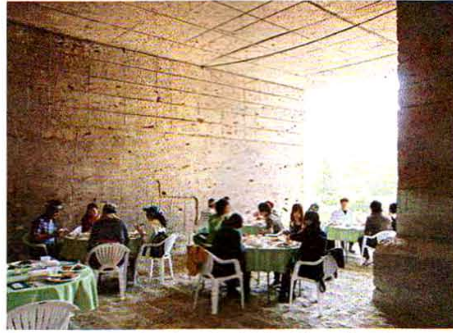
Participants enjoy lunch made with local ingredients in a space hewn from an Oya stone formation. It is part of one of the many former quarries in the Oya district in Utsunomiya.