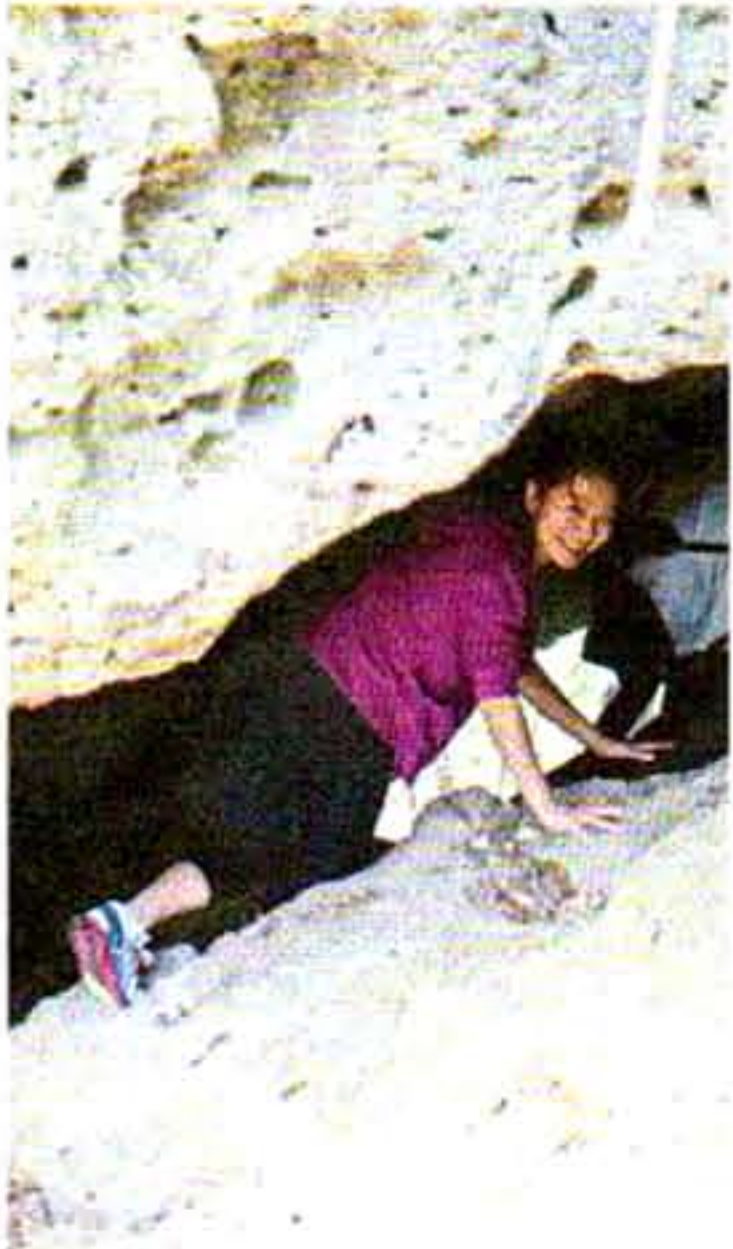
On the hiking trail, a participant explores a gap in an Oya stone formation.