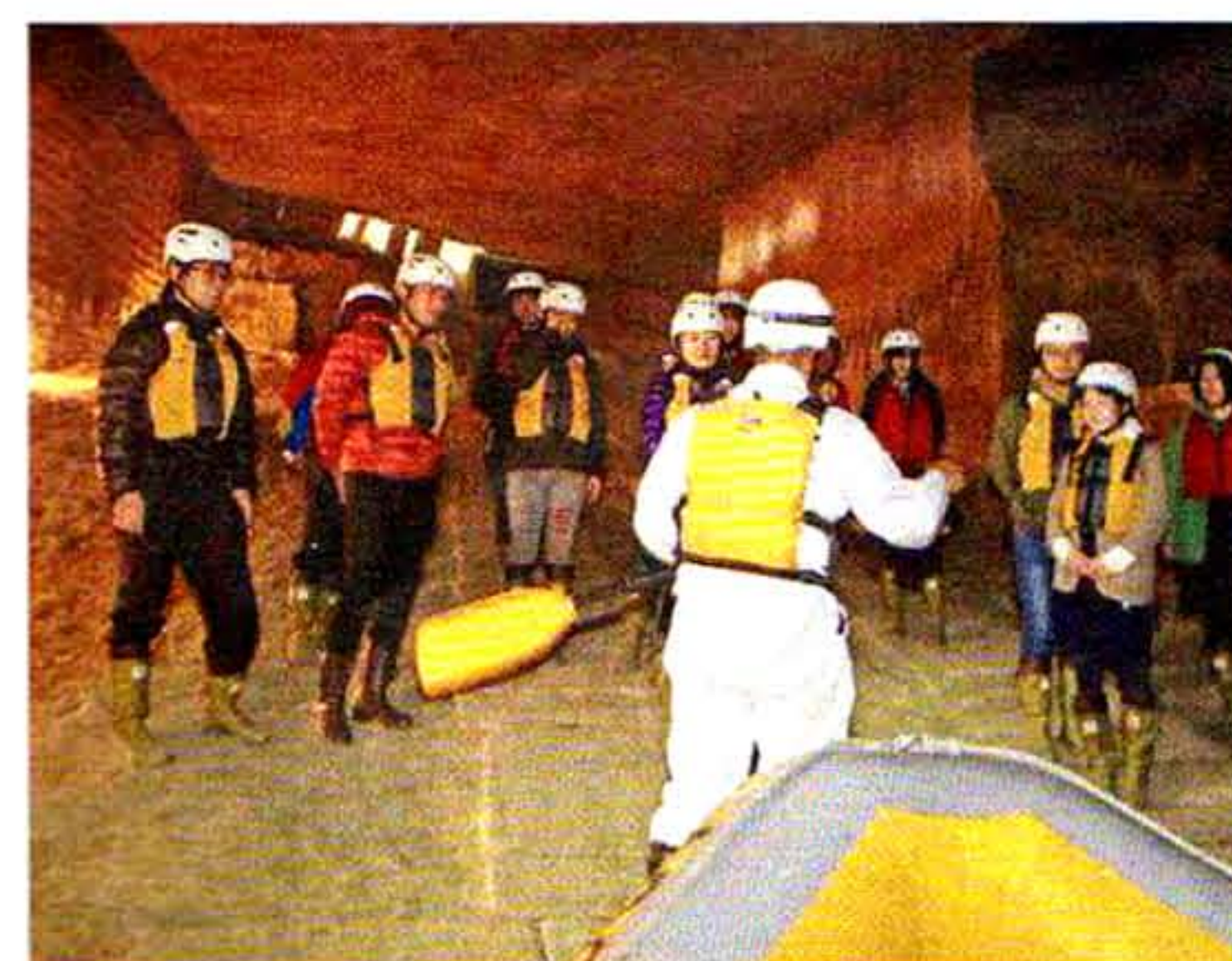
Participants receive paddling instructions before taking a rafting cruise on an underground lake.

"I came across the tour while I was looking on the Internet for tours to rarely visited regions," he said. "It was really mysterious to sail by boat on dark